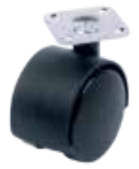
2 x castor flange (*)

(*) included in the standard configuration