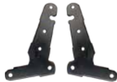
set backrest bracket male (*)