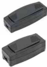
Transfo with or without battery backup facility