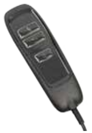
Handset Styline (1 motor lift)