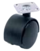
2 x castor flange (*)

(*) included in the standard configuration