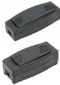
Transfo with or without battery backup facility