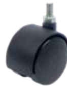
2 x castor pin (*)