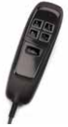
Handset Styline (2 motor lift)