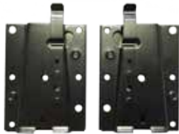
backrest bracket female LH / RH (*)