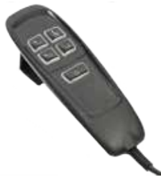
Handset Styline (2 motor lift)