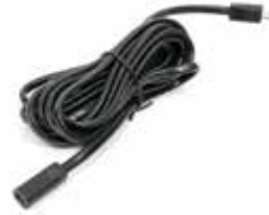
Extension cord 3,5m